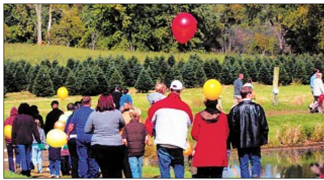
Submitted photo 'WALK TO REMEMBER' — The annual "Walk to Remember," sponsored by Wooster Community Hospital, was held on Oct. 11 at Pine Tree Barn. Participants also held a service and balloon launch in memory of their loss. October was National Pregnancy and Infant Loss Awareness Month.